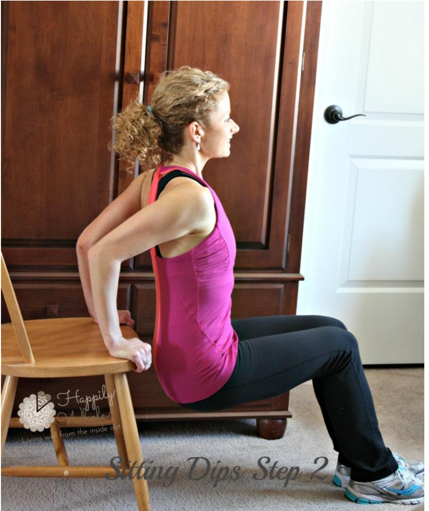
Sitting Dips Step 2